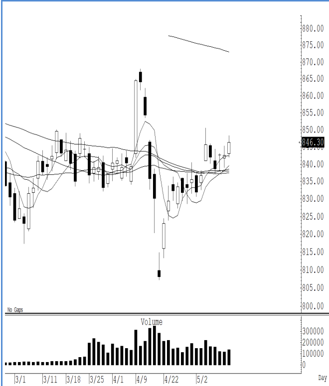
S50M24 (Close 846.30 Chg 3.80)